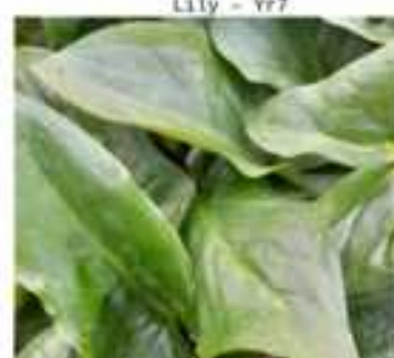
Lily – Yr7