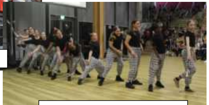
3 rd place – All Years Dancing / Baton Performing Group