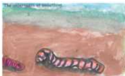
Divine – Yr8

Next , we are aiming for the Platinum Award , our first step towards that is that we have joined up with the creativity dept and Miss Armstrong for some macro photography in the year 10 GCSE Photography Class.